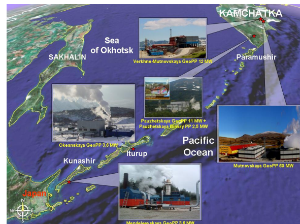
Figure 4: Location of existing geothermal power plants in Kamchatka and Kuril Islands

reserves of the most northern island of Kuril ridge - Paramushir, calculated by various methods, can support operation of a geothermal power plant with capacity of 15-100 MW. A similar geothermal power complex is under construction at Iturup Island. It will permit supplying electricity for Kurilsk city. Construction of a geothermal power plant is implemented on site at the foot of Baransky volcano, 21 km away from Kurilsk city. Two power modules were installed on two sites, with total capacity of 3.6 MW. In 2006 I start-up complex with capacity of 1.8 MW was commissioned. Reserves of fluid for Okeansky reservoir, "Kipyashchy" area, ensure a geothermal power plant's capacity of 5.0 MW. Geothermal heat supply of Kurilsk city is not planned, due to the terrain relief complexity.