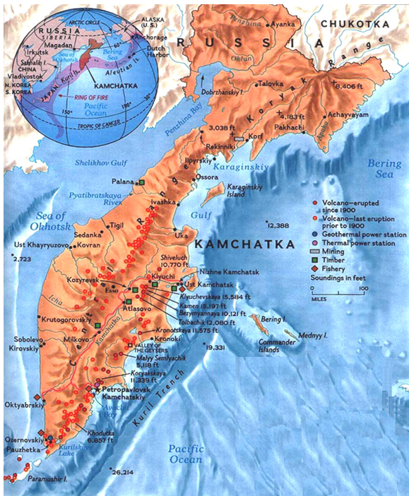
Figure 3: Kamchatka and Kuril Islands – active volcanoes zones

Practically all territory of Kamchatka has geothermal heat available in the form of hot water, two-phase fluid and steam. In the south of Kamchatka near the Pauzhetskaya GeoPP, exploration of the Koshelevskaya geothermal system has discovered resources sufficient for GeoPP, with a capacity of about 350 MW.