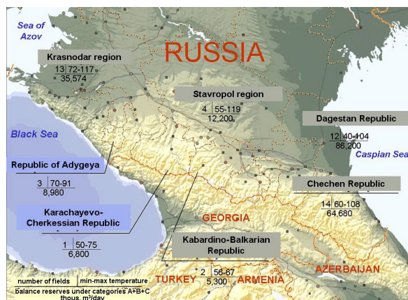
Figure 2: Geothermal resources of the Southern part of Russia (Krasnodar and Stavropol regions, Dagestan and Chechen Republics)

Totally in Dagestan about 180 wells have been drilled at a depth from 200 to 5500 m. The regions of such towns as Kizlyar, Tarumovka and Jushnosukhokumsk, possess unique reserves of hot water. For instance, Tarumovskoye deposit has the reserves of geothermal water of high salinity (200 g/l) with temperature up to 195°C. Six wells have been drilled to depths of about 5500 m, the deepest geothermal wells in Russia. Tests indicate high reservoir permeability with wells producing between 7,500 and 11,000 m 3 /day at wellhead pressures of 140-150 bara. Magamedov K.M. et. al. (1999)