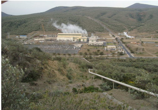
Figure 2: Olkaria II 105 MWe Plant, Naivasha Kenya

In managing the park KWS personnel monitor the patterns of animal movement and carry out quarterly animal census in addition to their regular research. Environmental Audits are also conducted by KWS within the park and follow-up reports with mitigation measures to be implemented are sent to the KenGen environment offices for action. The geothermal power plants have therefore not altered significantly the ecology of the surrounding National Park.